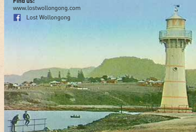
The Wollongong Museum Trail is proudly supported by:

Find us: www.lostwollongong.com f Lost Wollongong